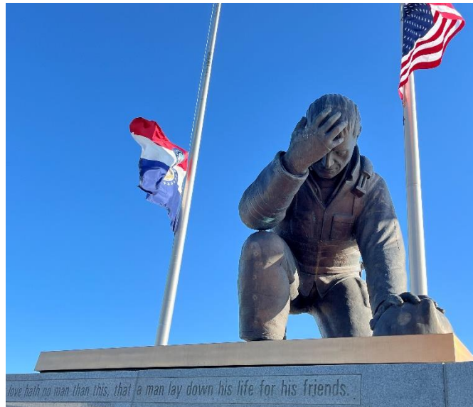
Missouri Fire Fighters Memorial October 4, 2025